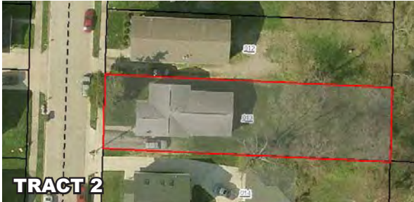
Tract 2: 505 N. Campus Ave. -Updated unit with 4 bedrooms, 2 full baths, main level laundry, gas furnace and central air.