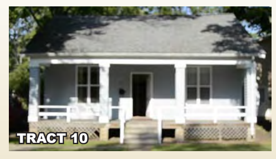
Tract 10: 418 S. Main St. – Updated 4 bedroom, 2 full bath house with gas furnace and central air.