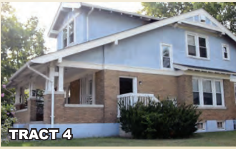
Tract 4: 231 W. Church St. – 6 bedroom unit with 2 kitchen areas and 3 full baths. Partially finished basement with large multi-purpose room. Gas furnace with detached garage.