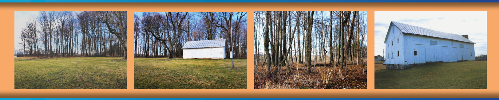
The information on this sheet is subject to verification and no liability for errors or omissions is assumed by the Schrader Agency.