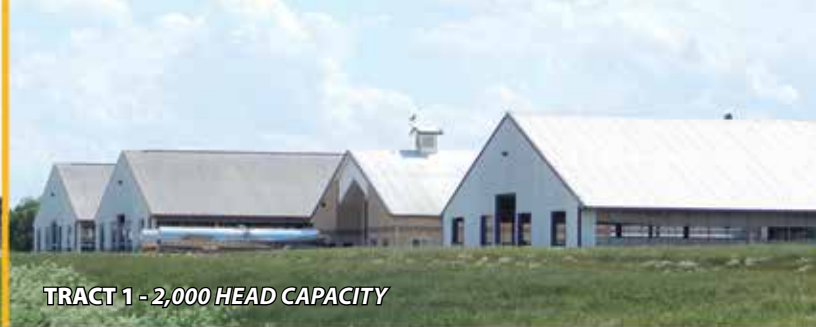
TRACT 1 - 2,000 HEAD CAPACITY