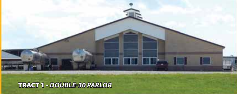
TRACT 1 - DOUBLE-30 PARLOR