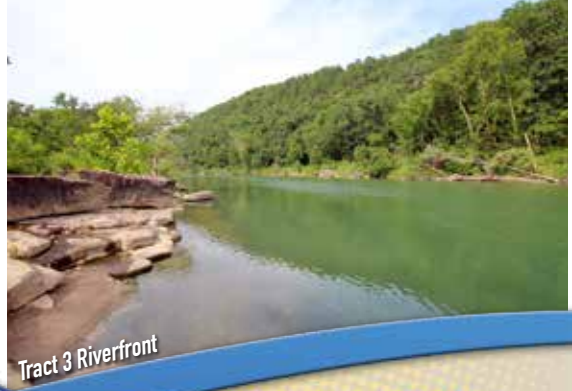
Tract 3 Riverfront