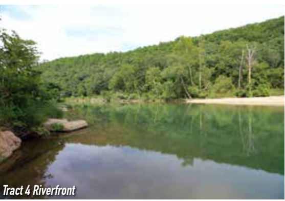
Tract 4 Riverfront