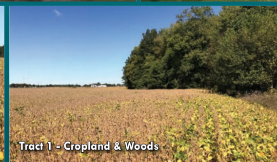
Tract 1 - Cropland & Woods