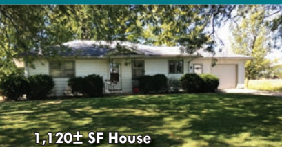
1,120± SF House