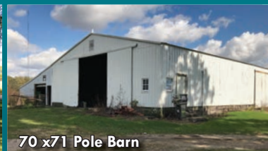
70 x 71 Pole Barn