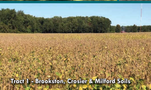
Tract 1 - Brookston, Crosier & Milford Soils