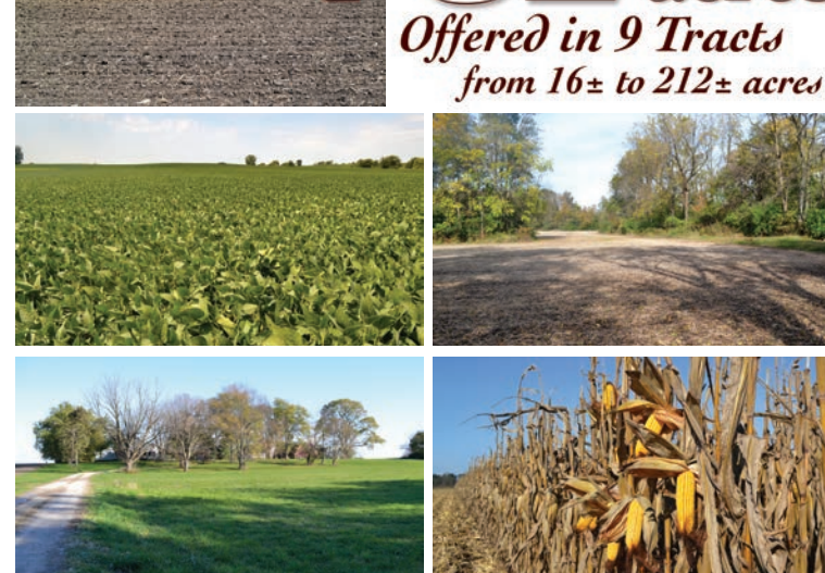
For FSA & soil information, please visit our website or contact the Auction Manager for a detailed information booklet.

DEED: Seller shall provide a Personal Representative's Deed sufficient to convey insurable