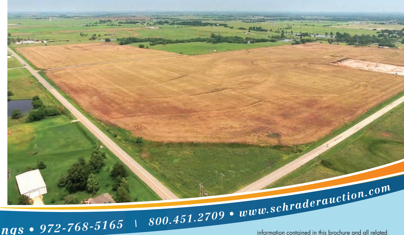
Meet a Schrader Representative at entrance to Tract 4.