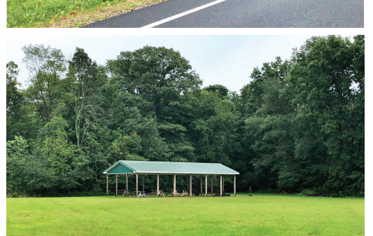
This FARM presents quality soils in a GREAT LOCATION. Examine the potential of agricultural income and future development potential.