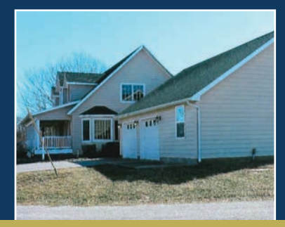
Any sale will be subject to obtaining Bankruptcy Court Approval.