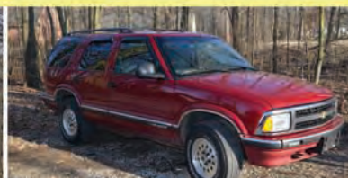
Truck, Trailer, Lawn Tractor