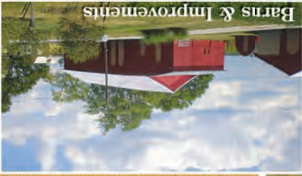
Barns & Improvements

SCHRADER Real Estate and Auction Company, Inc.