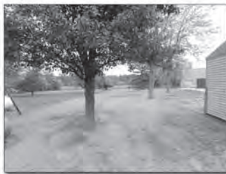
2 Bedroom Ranch Home