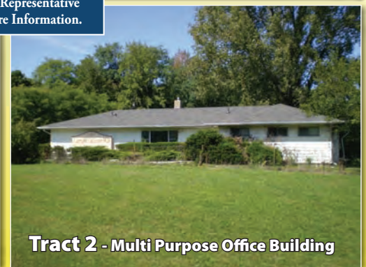
Tract 2 - Multi Purpose Office Building