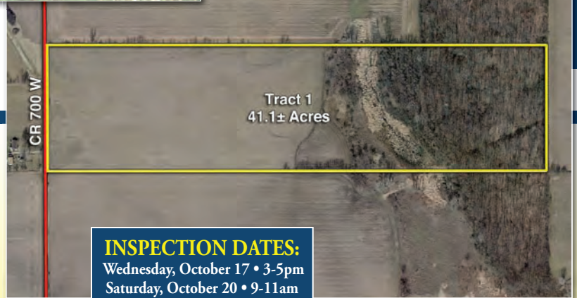
Tract 1 41.1± Acres

OUTSTANDING LOCATION Close to Indianapolis, Anderson & Muncie, Indiana