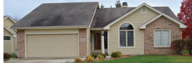
Autumn Ridge 2 Bedroom, 2 Bath Villa