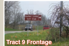
Tract 9 Frontage