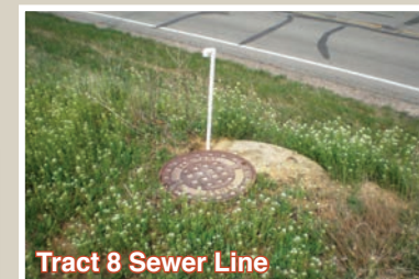
Tract 8 Sewer Line

INSPECTION DATES: Sat, May 25 & June 8 • 9am - Noon Meet a Schrader Agent on Tract 4