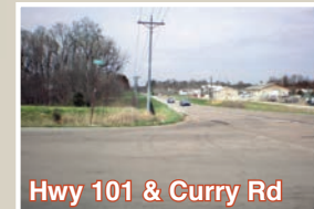
Hwy 101 & Curry Rd