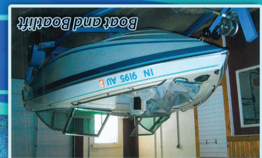
Boat and Boatlift

Auction will be held on site at 2831 Barrett Road