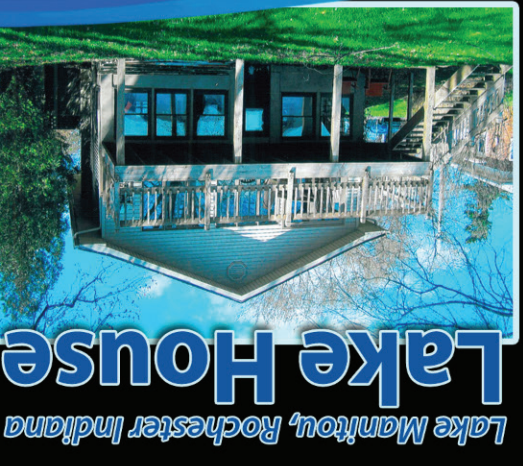
Lake House Lake Manitou, Rochester Indiana