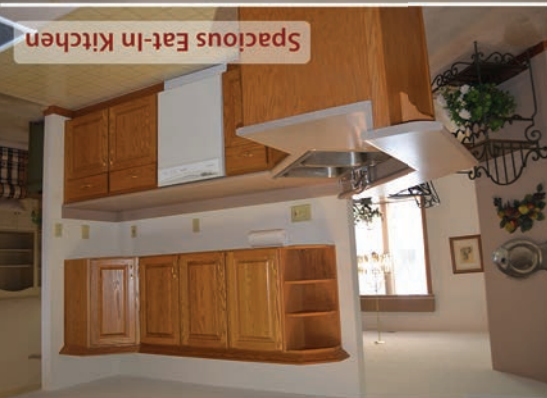
Spacious Eat-In Kitchen