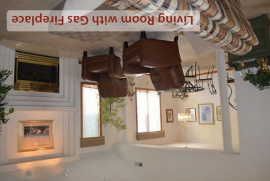
Living Room with Gas Fireplace