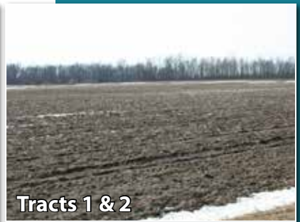
Tracts 1 & 2