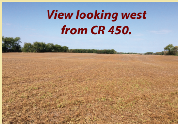
View looking west from CR 450.