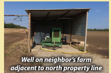
Well on neighbor's farm adjacent to north property line

The information on this sheet is subject to verification and no liability for errors or omissions is assumed by the Schrader Agency.