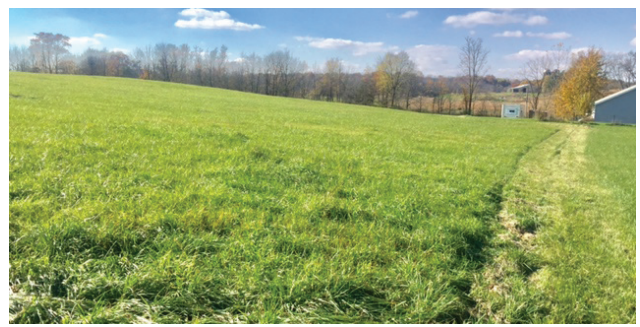
This is a 14 acres residential development piece of land. It has two access points to a street. Water, sewer, gas, and electric are at site. An area for retention is already available.