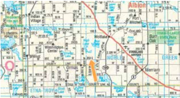
PROPERTY/AUCTION LOCATION: 5426 W 350 S, Albion, IN 46701