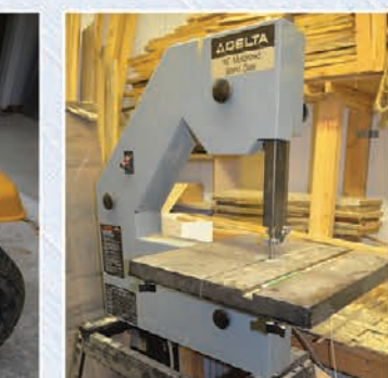
Wednesday, November 11 • 3pm. Woodworking Equipment, Wood, Tools, Lawn & Garden