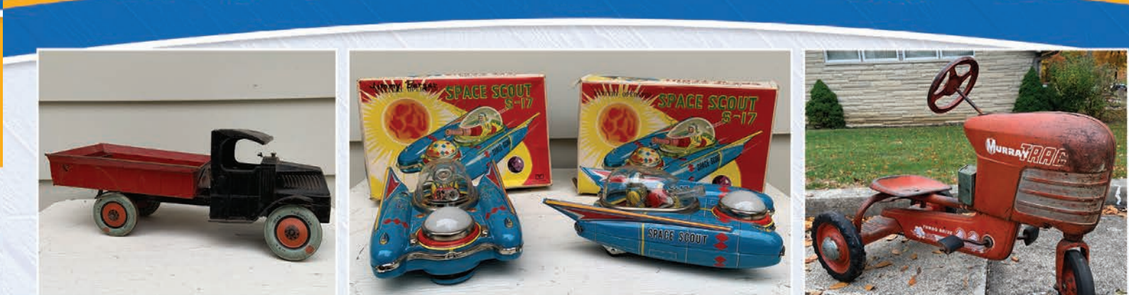
Saturday, November 7 . 9 am: Antiques, Collectibles, Furniture, & Housewares