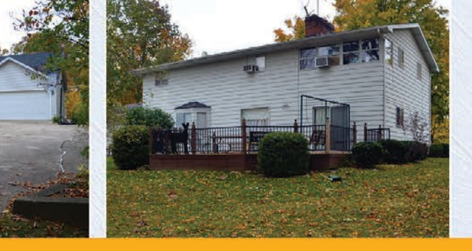
Thursday, November 12 • 6 pm: 5 Bed, 3 Bath Home on Full Basement, Plus Additional Lot

Located at: 2133 Beechmont Drive, Fort Wayne, IN 46825 | In Concordia Gardens & Woods