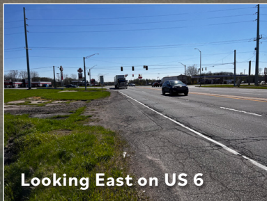
Looking East on US 6