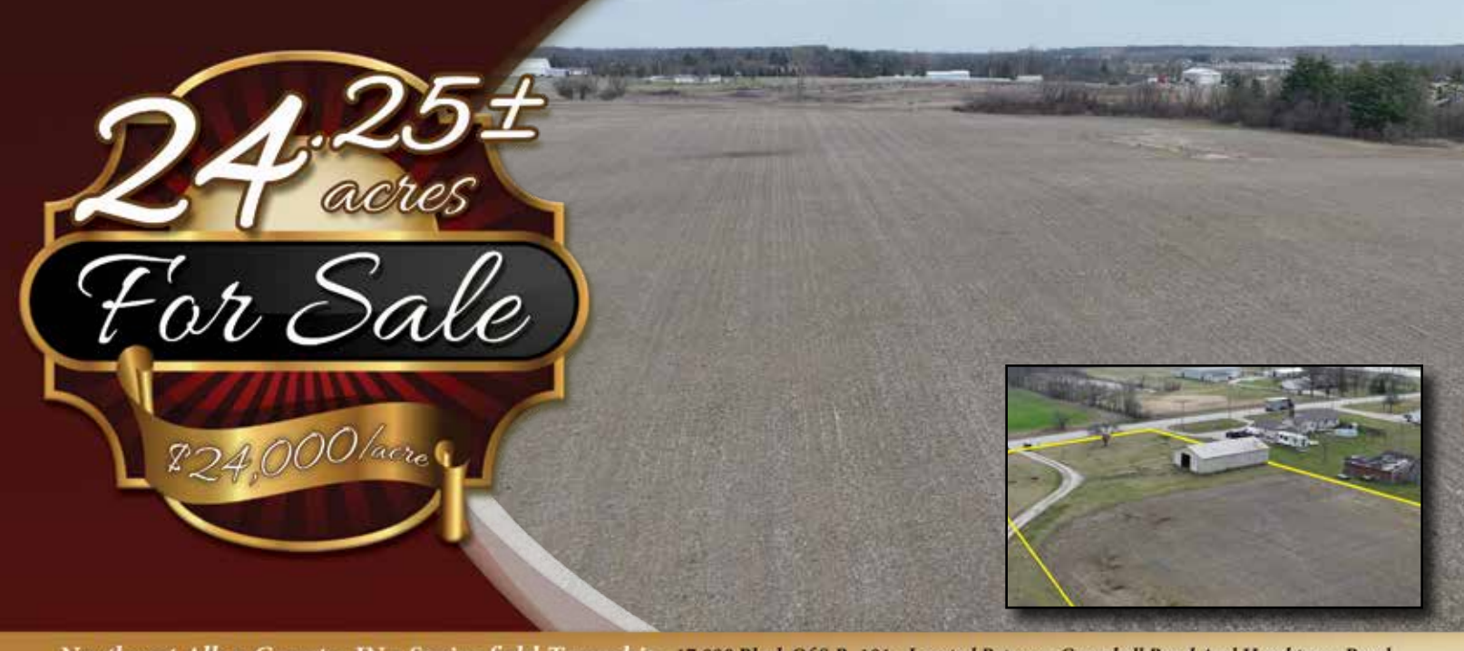
Northeast Allen County, IN . Springfield Township 17,000 Block Of S.R. 101 - Located Between Campbell Road And Hurshtown Road