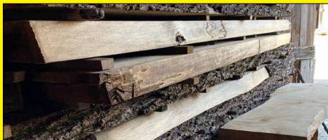
SAWMILL & LUMBER: Slab Wood: Cherry, Walnut, Sassafras, Cedar, Cherry boards, Spalted Maple